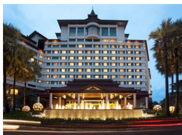
Sedona Hotel, Yangon

Address: 1 Kabar Aye Pagoda Rd, Yangon 11081, Myanmar (Burma)